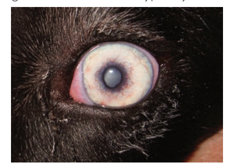
Lens induced uveitis demonstrating ectropion uveae and iritis.

Treatment of phacolytic uveitis should be undertaken in order to minimize the risk of secondary complications associated with chronic intraocular inflammation (notably retinal detachment and/or glaucoma). Treatment typically