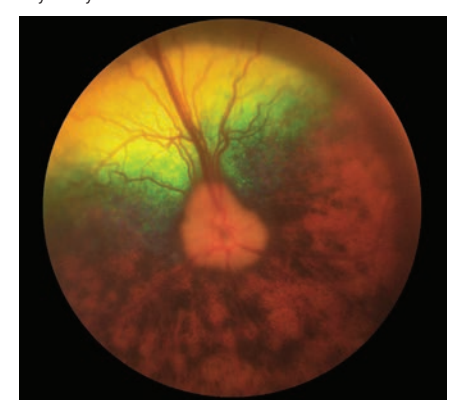
UDS displaying chorioretinitis marked by multifocal depigmentation.

UDS represents an immunemediated disease affecting melanocytic tissue, which likely has a hereditary etiology and which exhibits many similarities to Voqt-Koyanagi-Harada (VKH) disease in humans. Ocular symptoms associated with UDS may include inflammation marked by any combination of anterior