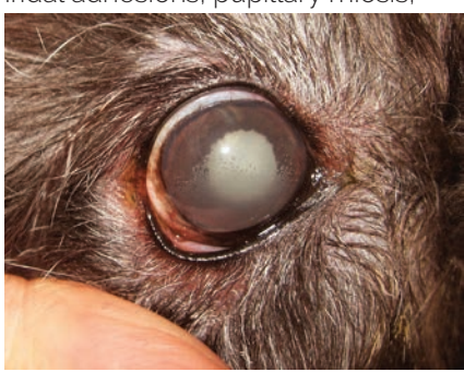
Lens induced uveitis exhibiting corneal endothelial keratic precipitates and posterior synechiae in a diabetic patient.

Clinically, phacolytic uveitis may manifest as any combination of conjunctival/episcleral hyperemia, corneal edema, endothelial keratic precipitates, aqueous flare, iritis, iridal adhesions, pupillary miosis,